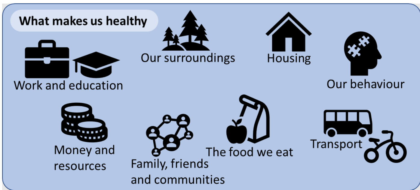
Figure 1 What makes us healthy. Adapted from The Health Foundation

Healthy people are at the core of healthy societies. Yet health is more than just the absence of disease. The World Health Organisation defines health as “a state of complete physical, mental and social well-being”. When it comes to health, accessible and high quality health care is important, but as little as 10% of a population’s health and wellbeing is linked to access to health care. Many other factors, such as the home and the community we live in, our environment, work, education and money, influence whether we are healthy and happy. It is therefore crucial to address these and create an environment that enables people to be as healthy as they can.